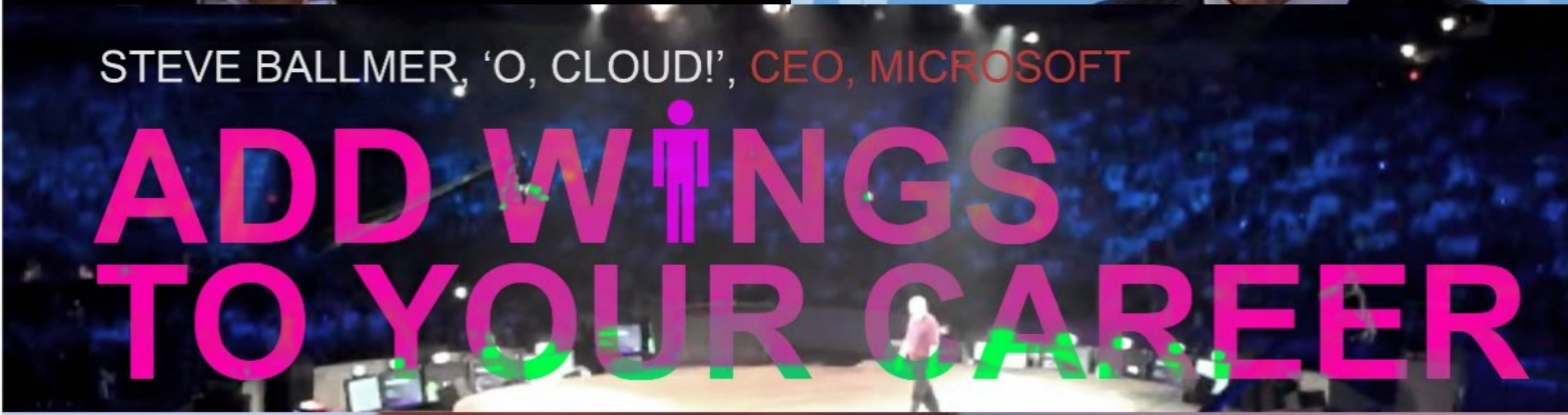
STEVE BALLMER, 'O, CLOUD!', CEO, MICROSOFT