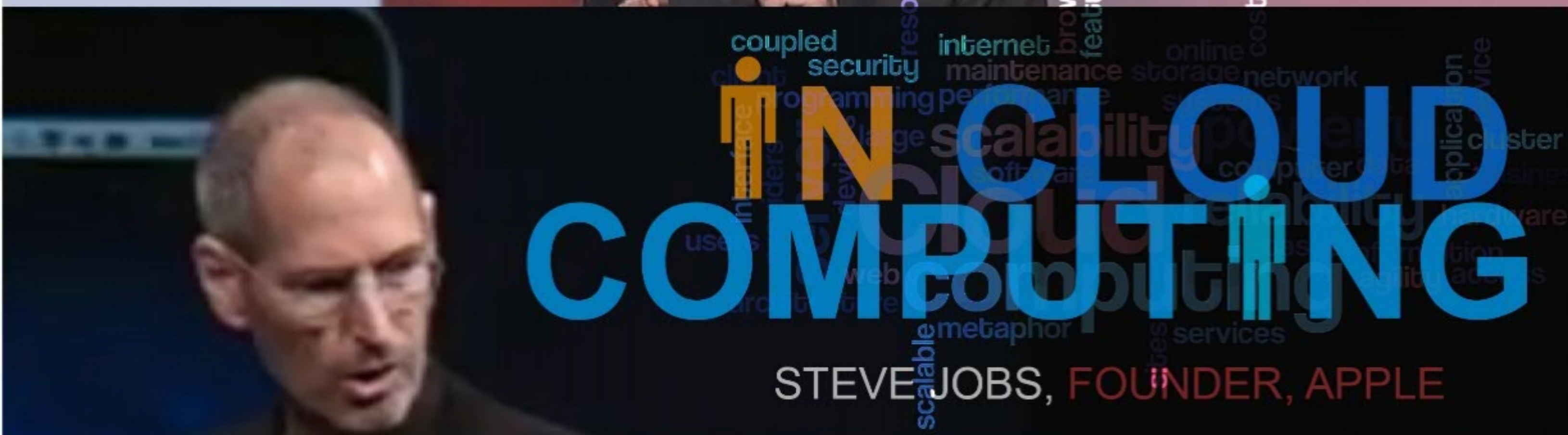
STEVE JOBS, FOUNDER, APPLE