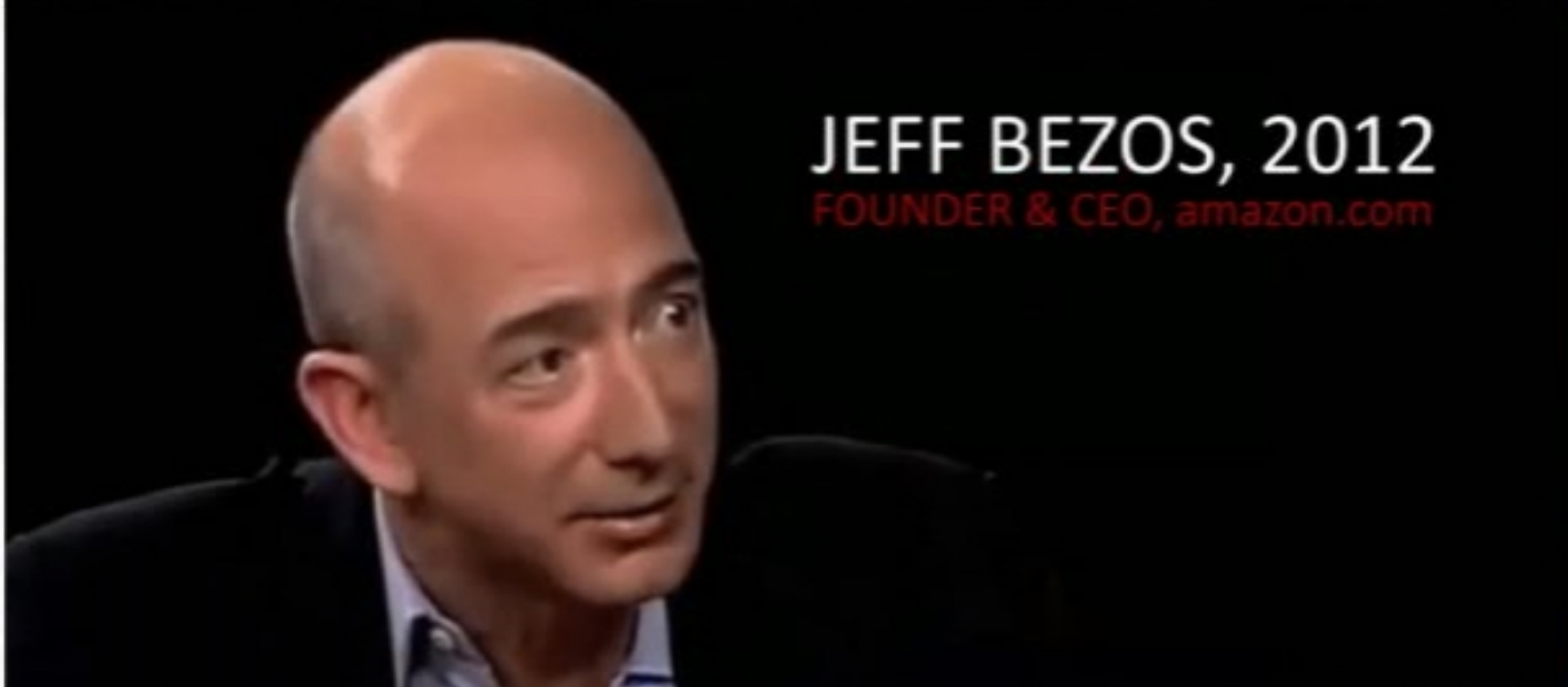
JEFF BEZOS, 2012 FOUNDER & CEO, amazon.com