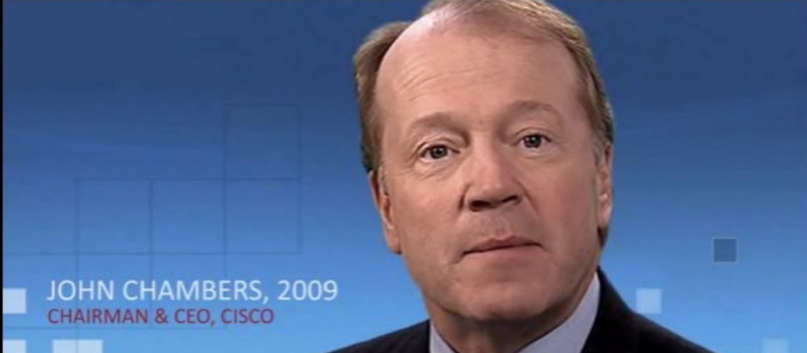
JOHN CHAMBERS, 2009 CHAIRMAN & CEO, CISCO