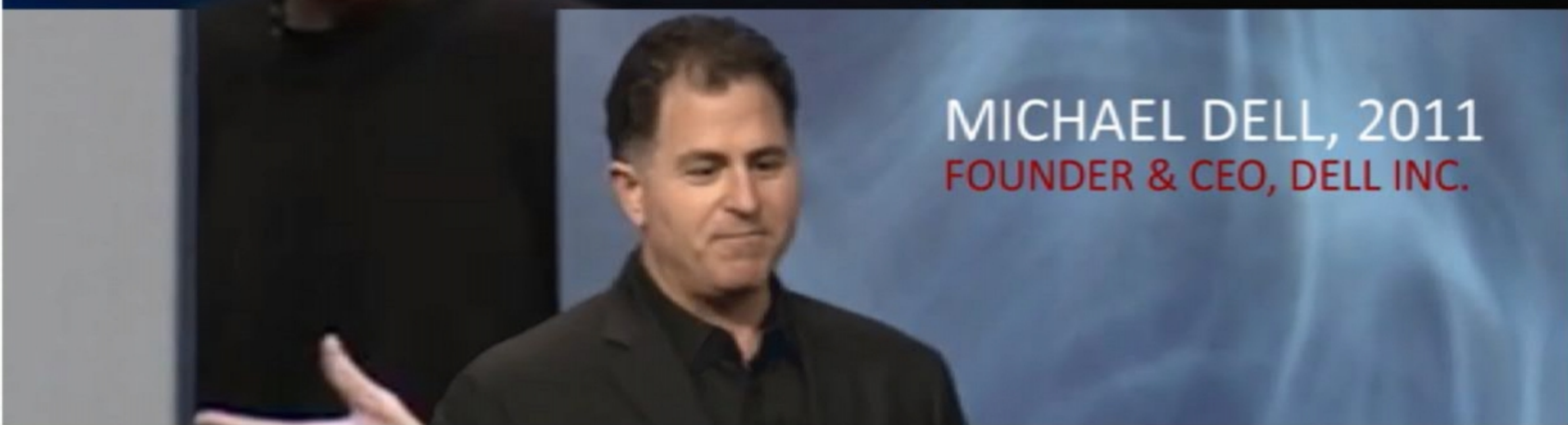
MICHAEL DELL, 2011 FOUNDER & CEO, DELL INC.