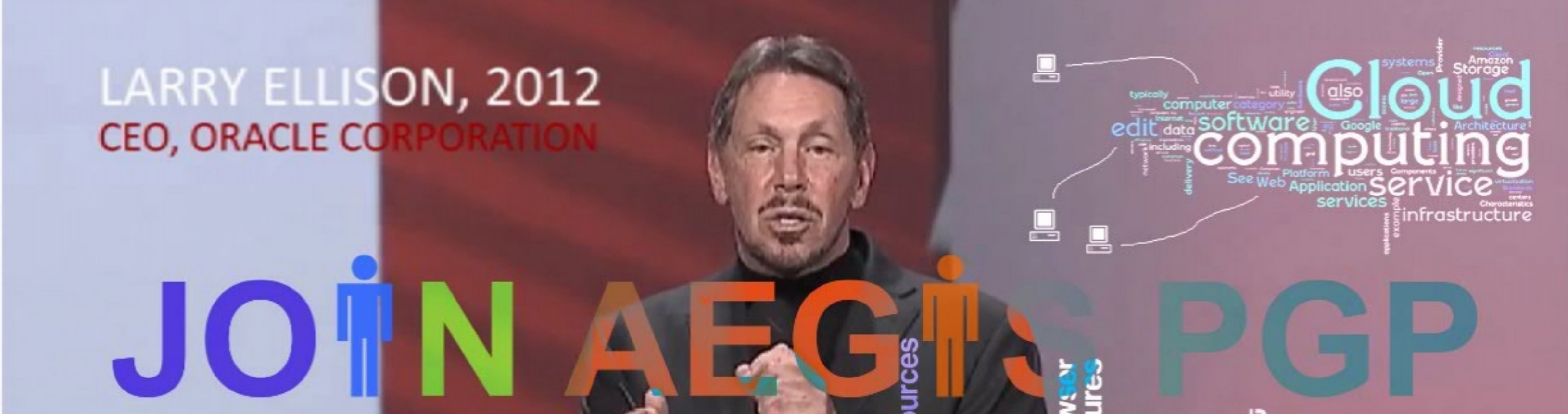
LARRY ELLISON, 2012 CEO, ORACLE CORPORATION